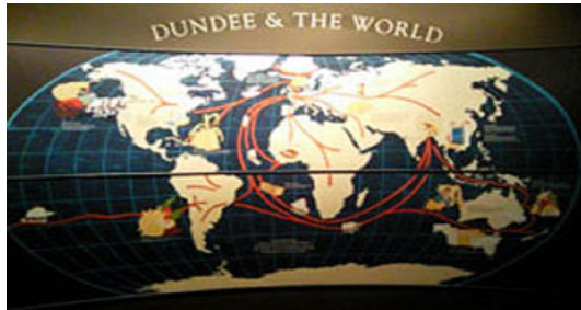
The rise of the jute industry in Dundee and export of raw jute from the Indian sub-continent.