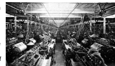
Dundee Jute Mill in Scotland. The Entrepreneurs of the Dundee Jute Industry in Scotland were called The Jute Barons.