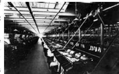
Dundee Jute Mill in Scotland. In 1833, Jute fibre was spun mechanically in Dundee, Scotland.